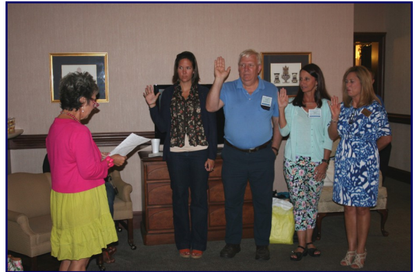
Guidance Division 2012-2013 Officers being sworn in at Miller-Motte Reception.